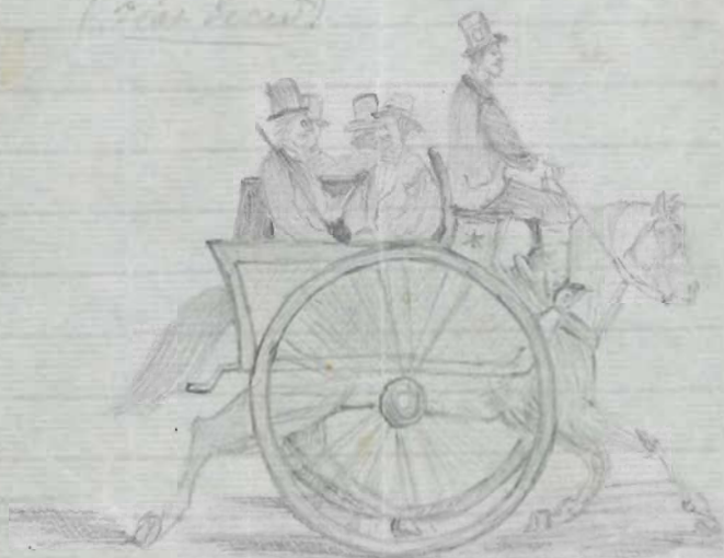
The "Equibus" Latest Yankee Invention